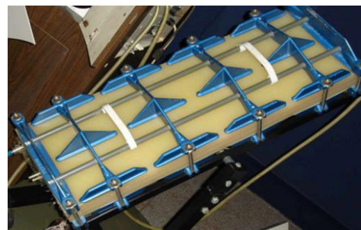
Fig. 3 : Kiil artificial Kidney (from the name of the urologist who designed it)